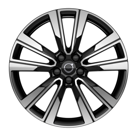
19" 5-Double Spoke Black Diamond Cut Alloy Wheel Standard on Ultra