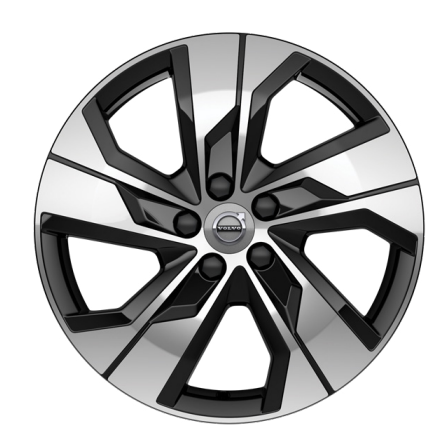
18" 5-Spoke Black Diamond Cut Alloy Wheel Standard on Plus