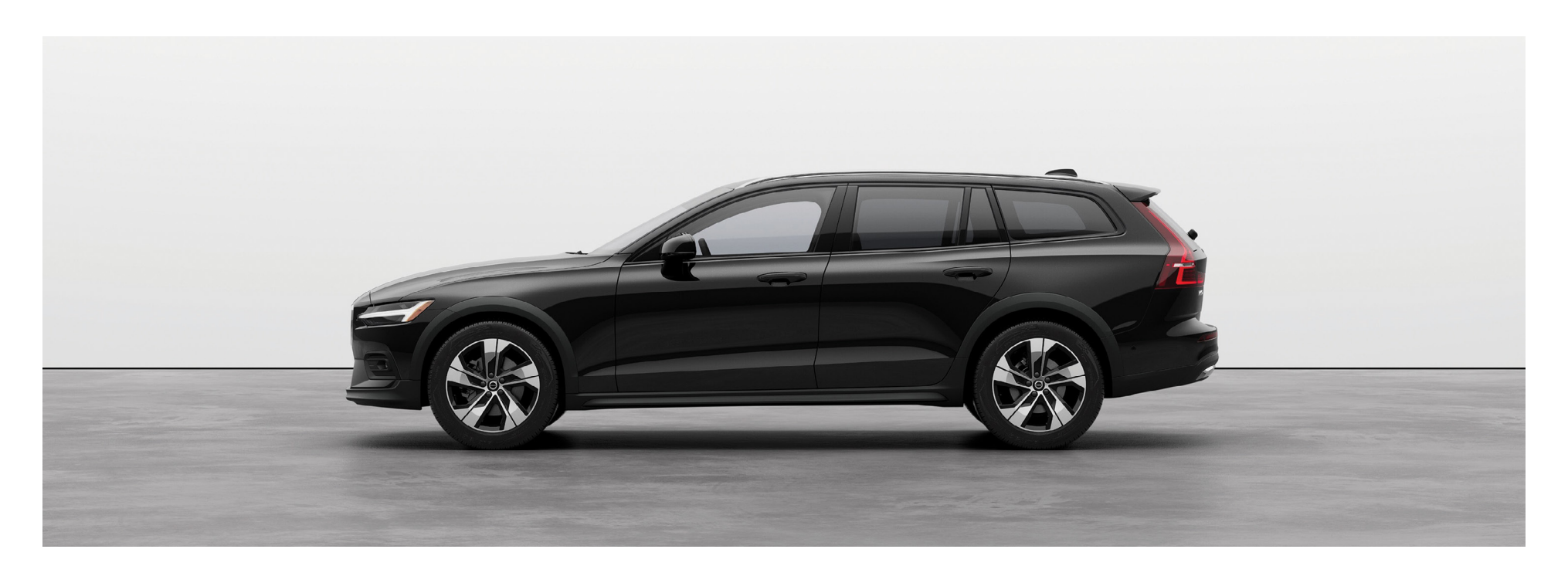
Availability varies by trim. Visit https://www.volvocars.com/us/ for information on availability.