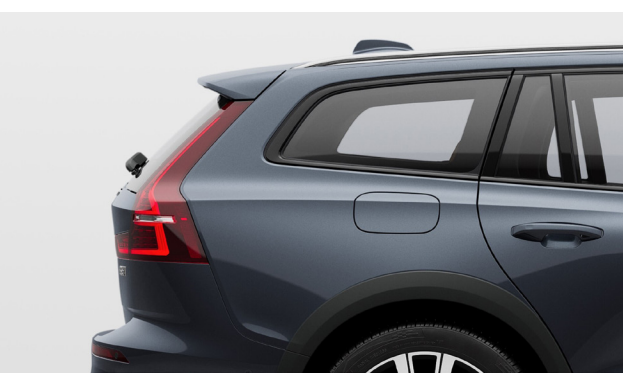
Denim Blue Metallic