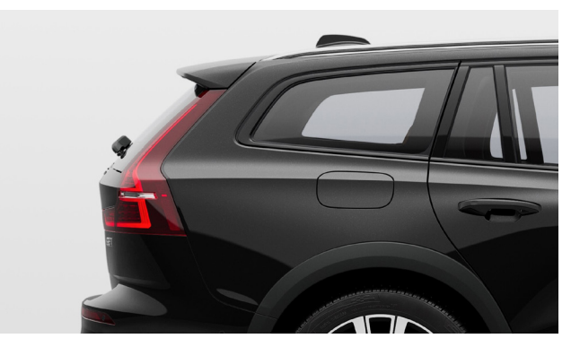
Onyx Black Metallic