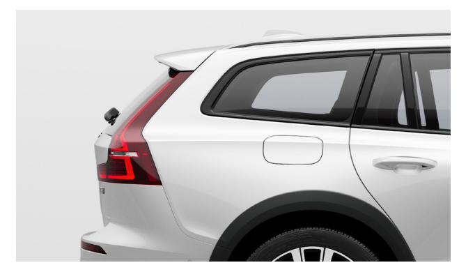
Crystal White Pearl