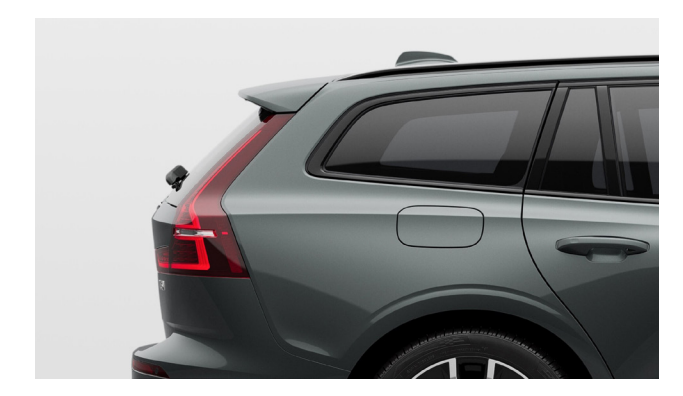
Forest Lake Metallic