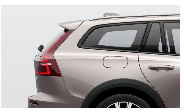
Bright Dusk Metallic