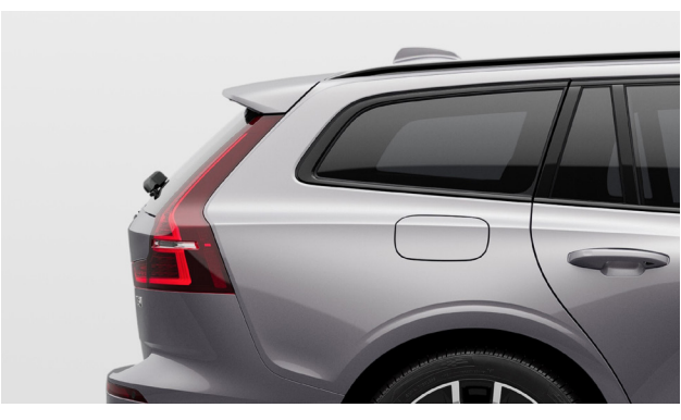
Aurora Silver Metallic