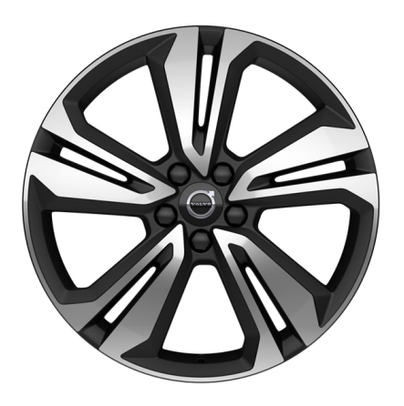
19" 5-Double Spoke Matte Graphite Diamond Cut Alloy Wheel Optional on Plus